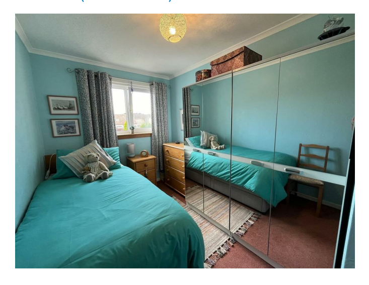
Window to front; fitted carpet; ceiling light fitting.