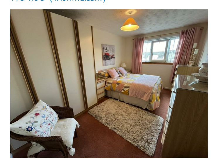
Window to front; fitted carpet; ceiling light fitting.