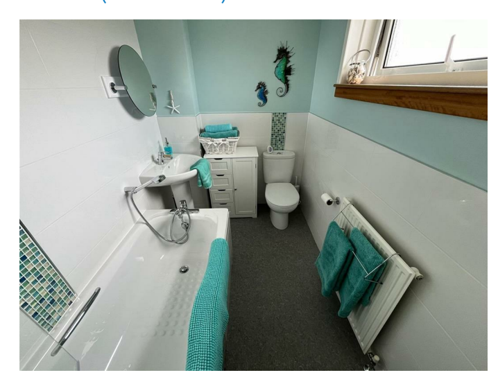
Window to rear; WC, sink and bath with electric shower over; vinyl flooring; ceiling light fitting.