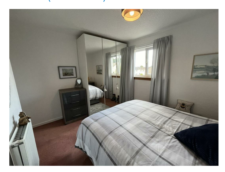
Window to front; fitted carpet; ceiling light fitting.