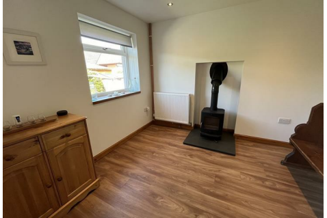
19 Lodge View, Hopeman, IV30 5TS