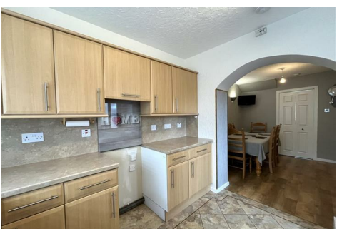
108 High Street, Rothes, AB38 7AY